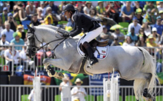
Rahotep de Toscane