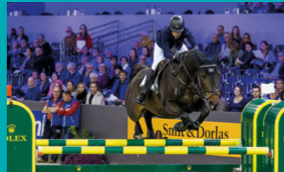
Geena Van't Roosakker