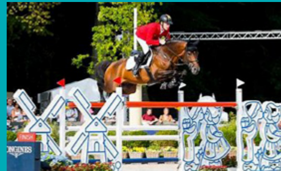
Comme Il Faut